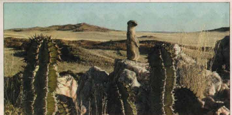
■ True hosts: Two of four semi-tame suricates welcoming guests on the terrace of Rostock Ritz.